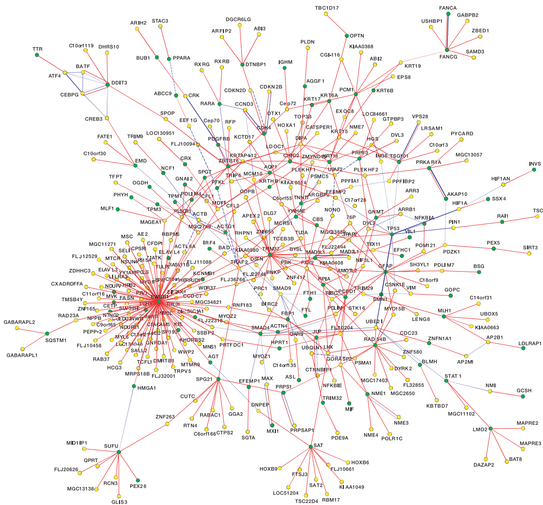
Figure 3 | Interaction network of disease-associated CCSB-HI1 proteins. The network has 121 OMIM disease-associated proteins (green nodes) and 424 CCSB-HI1 interactions involving them (red edges), along with known LC interactions (solid blue edges represent binary LCI interactions and dashed blue edges represent non-binary interactions).

F(C) represents the fraction of gene- or protein-pairs (defined for each row) the given characteristic C. Assessed characteristics include shared mouse phenotype, shared upstream motif, correlated expression 30 and shared Gene Ontology annotation. 'All possible within Space-I' represents all possible gene- or protein-pairs in Space-I for which information regarding C is available. For each analysis of a shared characteristic, only gene- or protein-pairs for which both members had some annotation for that characteristic were considered. For analysis of correlated expression, only gene pairs with expression measurements for both genes were considered.